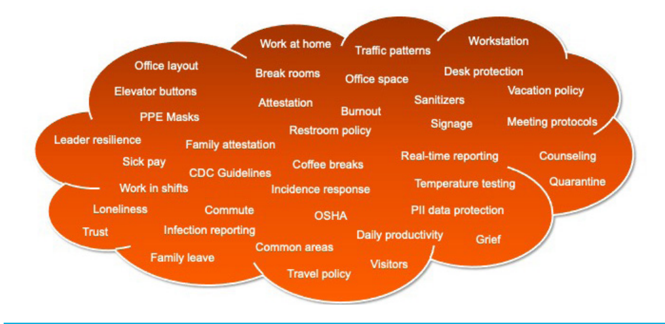
Figure 3: Employee Experience - After Coronavirus

Just as with customers, we need to develop a continuous employee listening strategy. The annual survey has its place in such a strategy, but it is not enough. Employee needs and issues are continually changing – and it's up to us to listen and take action on an ongoing basis.