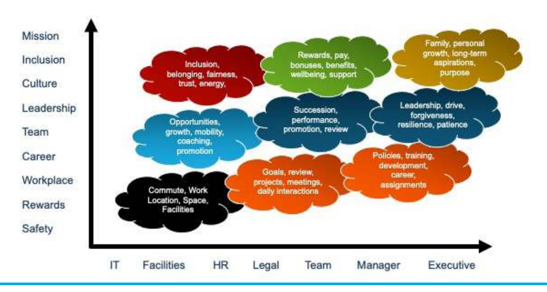
Figure 1: The Complexities of Employee Experience

The case is clear: listening to employees can have a massive impact on business performance and workforce engagement, but it needs to be done right. Listen frequently, understand what's behind the numbers, and take action quickly and decisively. These practices help identify issues and opportunities, engage the workforce in solving business problems, and create an environment where people feel valued and heard.