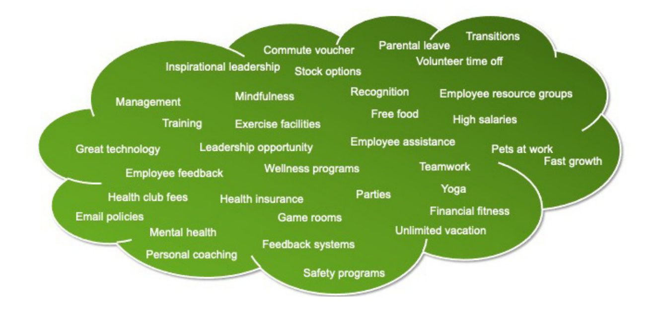
Figure 2: Employee Experience Before Cornavirus

Companies attuned to customer satisfaction don't rely on once-a-year surveys. They segment customers into groups, model their journeys, proactively elicit feedback, and analyze behaviors throughout the relationship. We can accelerate improvements in employee experience by learning from the best practices developed for customer satisfaction.